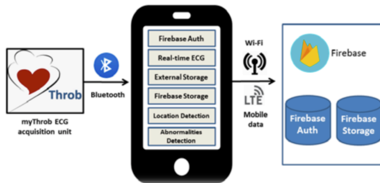
Fig. 1. Overall System Design

Fig. 1 shows the overall system design of proposed home-based ECG monitoring device. It consists of an in-house designed ECG acquisition unit, named myThrob , to capture a single lead ECG signal and send to a developed mobile application targeted for Android smartphone through Bluetooth wireless communication. The raw ECG data received by the mobile application can be displayed in smartphone in real time, and saved automatically as text files in local phone storage for future review. The build-in ECG signal processing will then analyze the ECG signal for classification of heart rate condition, in terms of normal sinus rhythm, sinus bradycardia and sinus tachycardia, respectively.